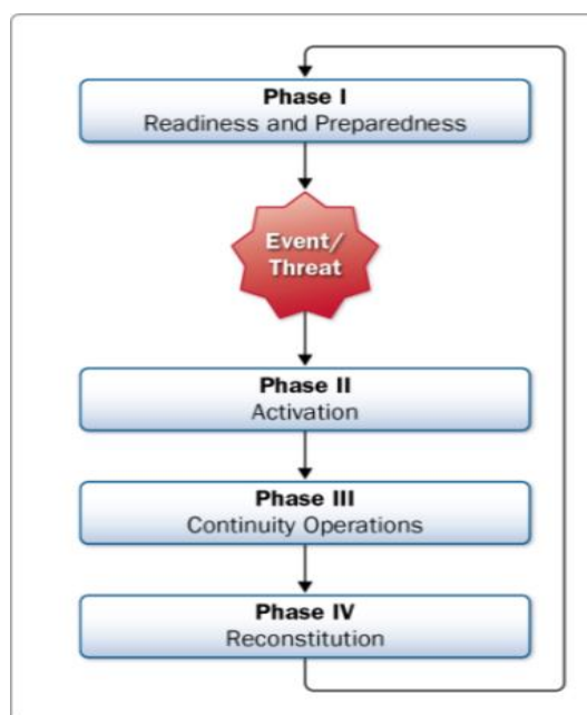
Figure L-1. Four Phases of Continuity

There are four phases of continuity operations: readiness and preparedness, activation, continuity operations, and reconstitution. These four phases should be used to build continuity processes and procedures, to establish goals and objectives, and to support the performance of organizational MEFs/PMEFs during a catastrophic emergency.