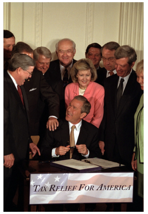
Surrounded by Members of Congress who supported the legislation, President Bush signs EGTRRA on June 7, 2001.

In addition, the benefit of the new 10-percent tax rate bracket was provided in 2001 through rebate checks mailed out between July and September 2001. About $36 billion in rate reduction