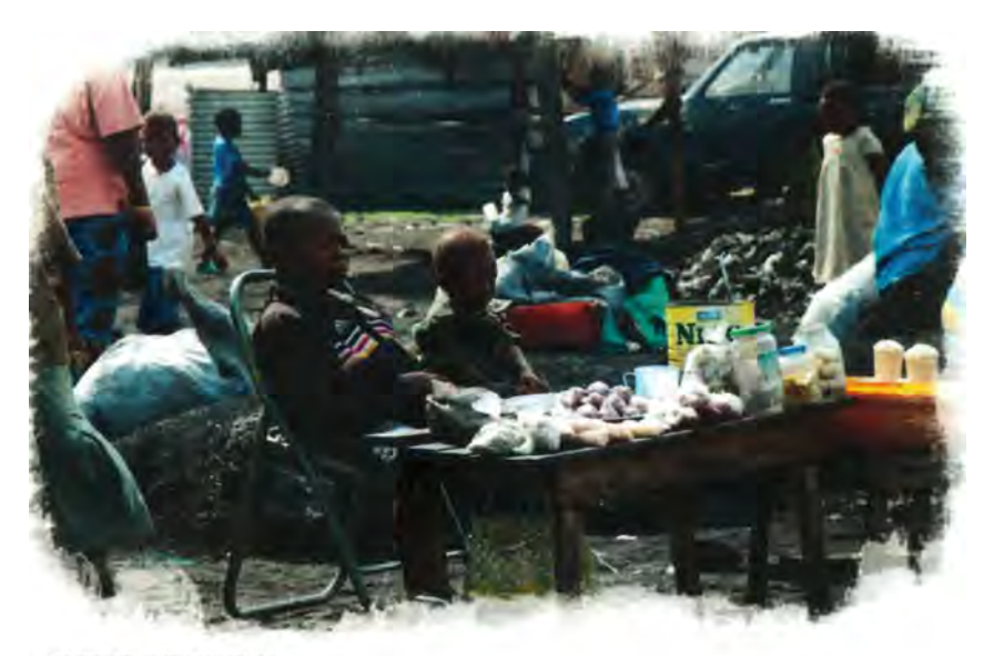
Most military families cannot afford to send their children to school. Children often work from a years age to contribute to the family income.

9. But these issues are as much a result of continued failures of SSR as they are the cause – and they do not present a compelling reason to ignore the need for SSR. The fact remains that the Congolese government consistently failed to give sufficient political backing for serious change. Most importantly, it did not take steps to end corruption, ill-discipline and weak command structures undermining reform efforts in the security sector. Despite President Kabila's high-profile declaration of 'zero tolerance' for sexual violence and corruption in July 2009, not enough has changed on the ground. Support to justice, investigation and anti-corruption efforts are minimal and inadequate – the Justice Ministry was allocated just 0.1% of government spending in 2011% and its budget reportedly fell by 47% between 2007 and 2009. Many in senior positions in the government and military continue to profit from corruption, either in raking off salaries, taking kickbacks, or involvement in illegal mining, trade or protection rackets.