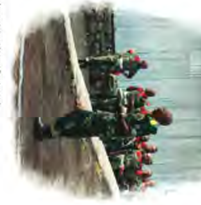
sender inspects his troops. Formal deman arts to the FARDC are relationly bywamed.

15. And, far from being 'post-conflict', the DRC continued to suffer from extremely serious bouts of violence. Through the post-2006 period, successive spikes of conflict or regional tension left the international community scrumbling to address acute short-term political crises or humanitarian emergencies. There were demands for immediate action against armed groups such as the CNDP, FDLR or LRA - necessitating the mass deployment of ineffective and poorly trained FARDC units."