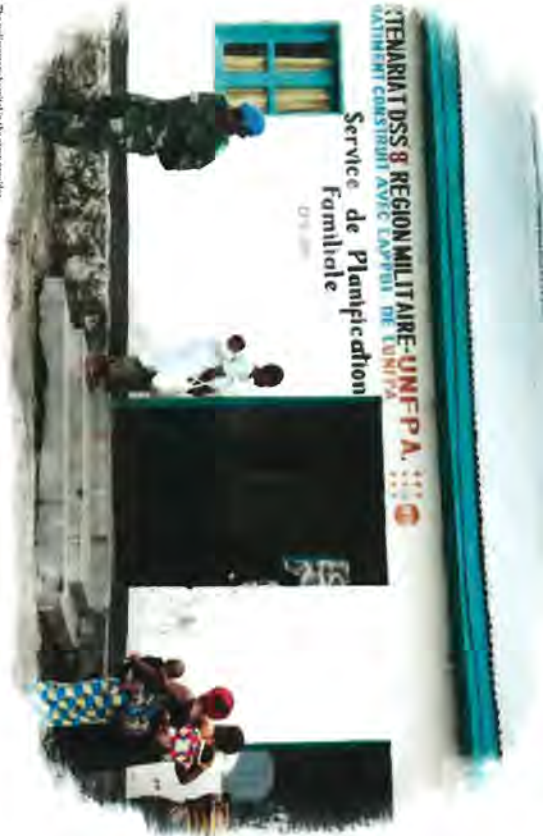
The rudimentary hospital in the earny provibasic medical services to military families.