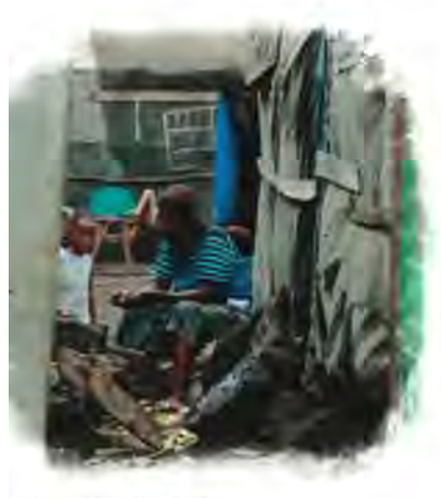
A military family living in Comp Ketines. North. Kiru. Most families in the speculing army camp. The location makes if attentions.

24. Regional organizations, most importantly the African Union (AU) and the Southern Africa Development Committee (SADC) have a pressing and legitimate interest in regional prosperity and stability. And the international financial institutions – frequently cited as the actors with the most significant leverage and access in Kinshasa<sup>71</sup>- are committed to helping the DRC achieve sustained economic growth. The IMF is the only actor currently providing direct budget support to the DRC government<sup>72</sup>.