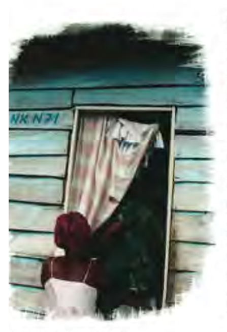
Officers' quarters at Comp Ratindo is Jones, Nort Kivu prevince. Originally intended to house 150 people, the camp is now home to more than 16,000 people including many soldiers' families.

6. Yet despite this consensus, military reform efforts have failed, both during the transition and afterwards. They have failed for two primary reasons. The first is the lack of political will on the part of the Congolese government; the second inadequate and poorly coordinated assistance from the donor community.