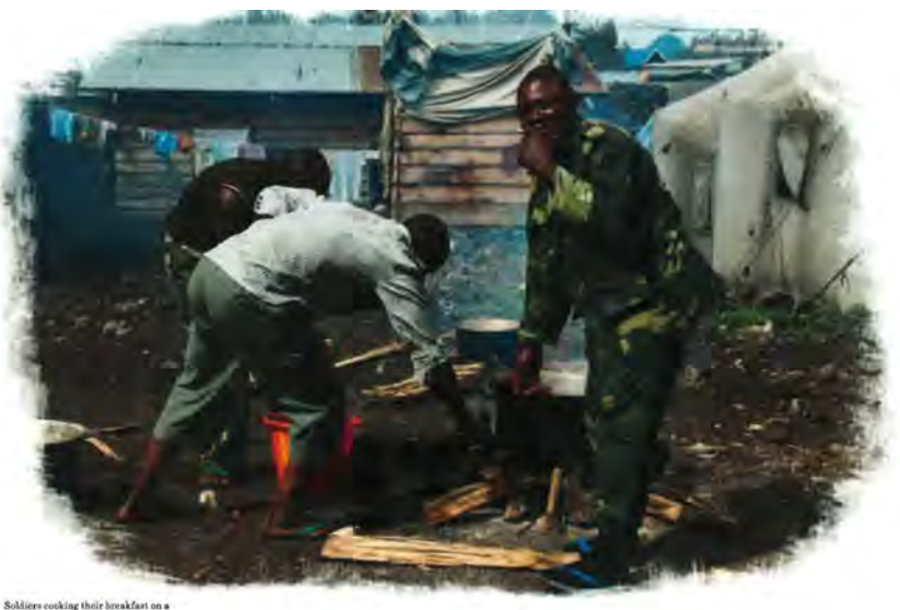
Soldiers cooking their breakfast on a sampfire, Many troops are missing basic requirements like military issue boots