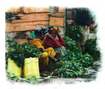
Military wives senk to supplement their farement is insmall-scale trade in the head markets. "We have to beg for support from our sequentances. The government.