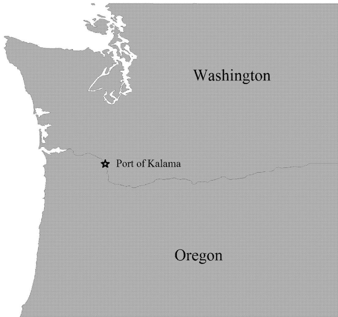
Figure 1. Project Region

The proposed upland project is designed to produce up to 10,000 metric tons per day of methanol from natural gas. The proposed manufacturing facility will have two production lines, each with a production capacity of 5,000 metric tons per day. The project site and infrastructure will be developed initially to accommodate both production lines. The anticipated yearly production at full capacity is