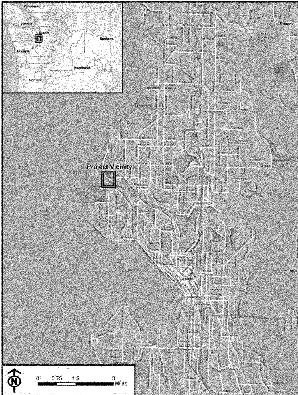
Figure 1. Railway Bridge 6.3 Location