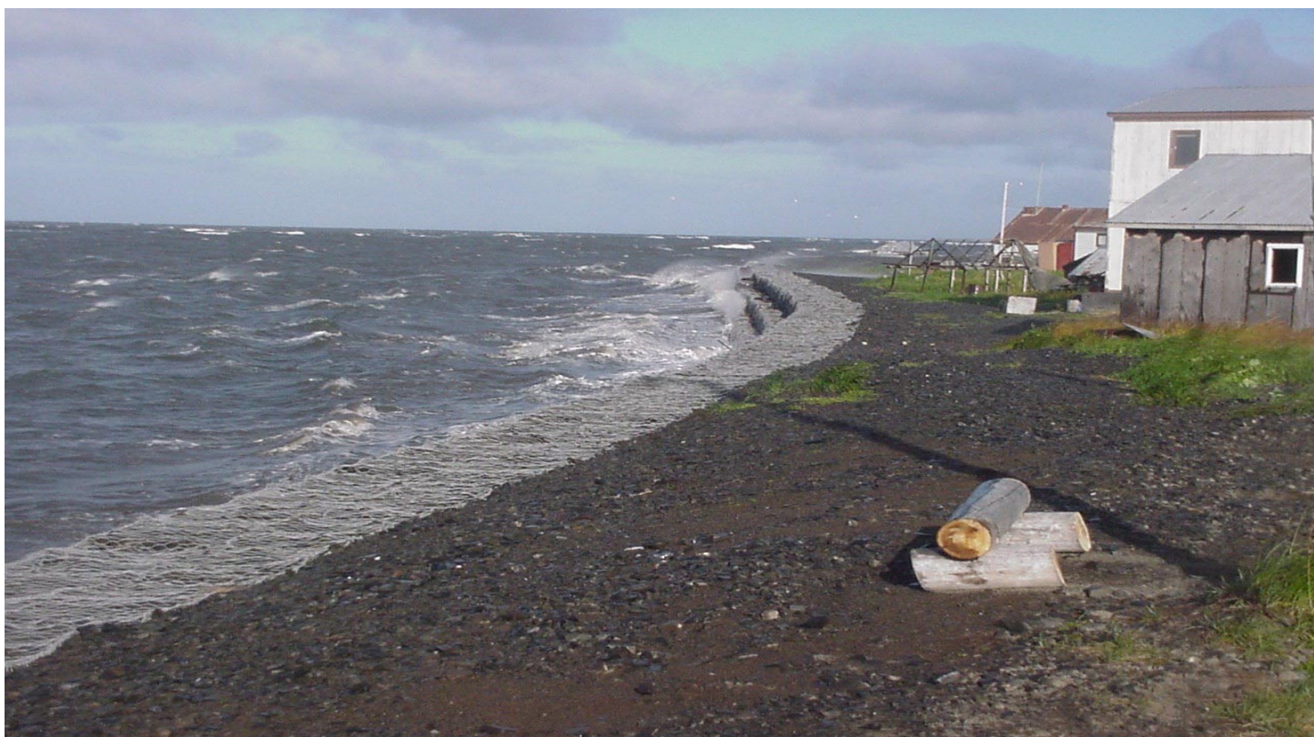
Figure 4: NRCS Seawall Erosion Protection Project at Unalakleet (c. 2000)