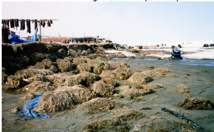
Bluff Erosion at the Native Village of Shishmaref (June 2003)

Although the Denali Commission and two federal agencies raised questions about expanding the role of the Denali Commission in commenting on GAO's report, GAO still believes it continues to be a possible alternative for helping to mitigate the barriers that villages face in obtaining federal services.