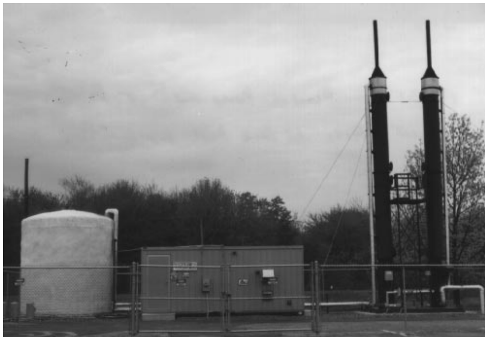
Figure 3.1: Groundwater Pump-and-Treat Pilot Project, Pease Air Force Base, New Hampshire

Pump-and-treat systems may need to be tested over several years to determine their effectiveness. For example, at two installations we visited, Norton and George Air Force Bases in California, pilot systems were in place, but officials said they were operating at about one-half of the capacity because the groundwater did not flow as expected. They said the number of wells for these systems will need to be increased for sufficient water to flow, and even if successful the systems may need to operate for 30 years or more. At Norton Air Force Base, groundwater contamination extends from the central base area, toward the southwest in the direction of groundwater flow beneath the base, and continues beyond the base boundary. There are several community water wells near the base within the anticipated path of the contaminants.