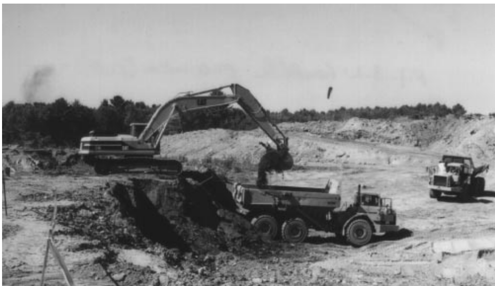
Figure 3.2: Landfill Excavation (below) and Soil Removal Project (page 30), Pease Air Force Base, New Hampshire.

National standards do not exist for cleaning up most contaminants in soil, so DOD, EPA, and state regulators negotiate standards for each site. Large landfills are often treated by placing a protective cap over the site to contain the waste and prevent further contamination of the soil, groundwater, and atmosphere. The groundwater conditions around the landfill must also be assessed to determine whether contamination exists, and, if necessary, identify the cleanup measures. Figure 3.2 shows a landfill excavation and a soil removal project.