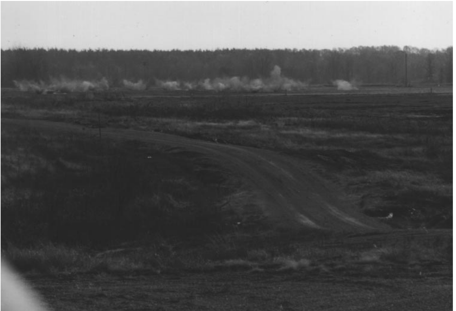
Figure 3.3: Portion of the Army's Jefferson Proving Ground Ordnance Range

Note: The smoke in the upper center of the photograph is from the impact of live munitions.