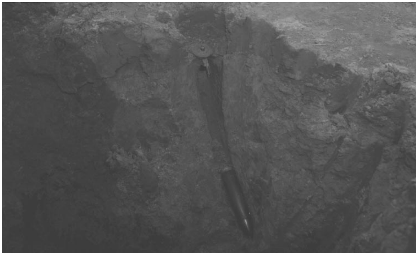
Figure 3.4: Item of Unexploded Ordnance Found Buried on the Army's Jefferson Proving Ground Range

land, mapping the unexploded ordnance, handling or removing it, and disposing of it. Because the installation potentially has 51,000 contaminated acres and is heavily forested, current cleanup technology is not practical or affordable. Although the cleanup plan included $216 million in estimated costs, the plan noted that costs could run to $2 billion a year for several years, and officials said other estimates for cleanup have ranged from $5 billion to $8 billion in total, depending on how the property is to be reused. Figure 3.4 shows an example of buried unexploded ordnance.