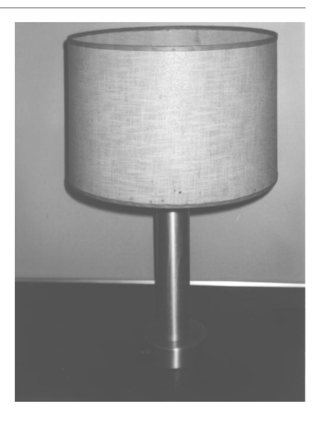
Figure 2.1: Example of the Type of Lamp Repaired by a Subcontractor