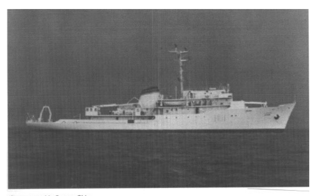
Oceanographic Survey Ship