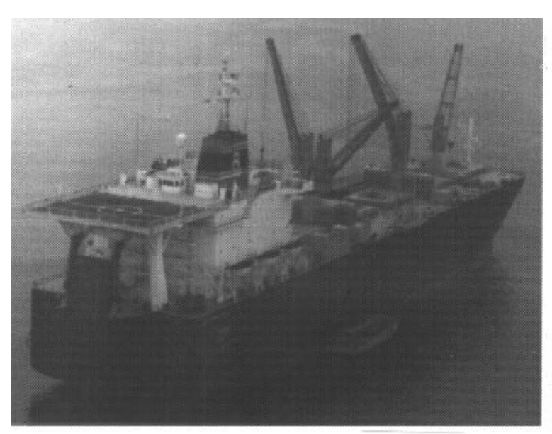
Figure 1.1: Contractor-Operated Ships