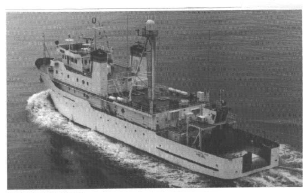
T-AGOS Surveillance Ship