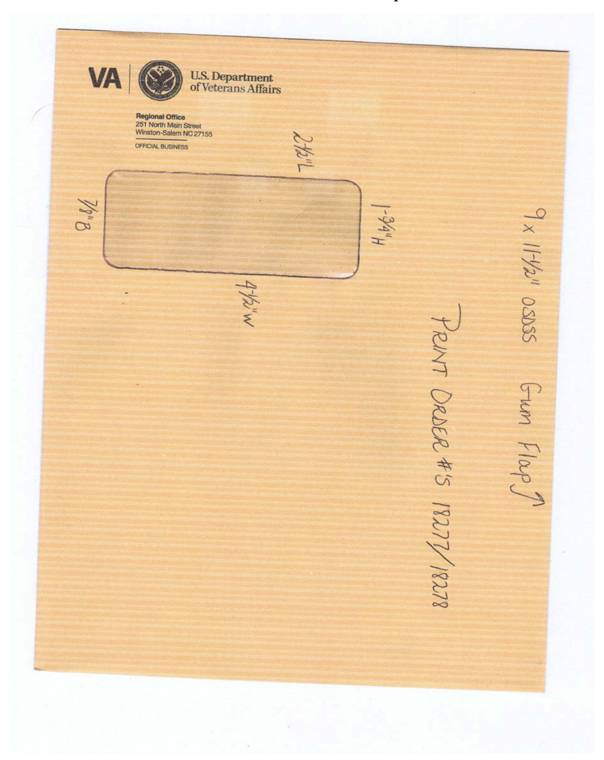
9 x 11-1/2" Kraft Window Envelope