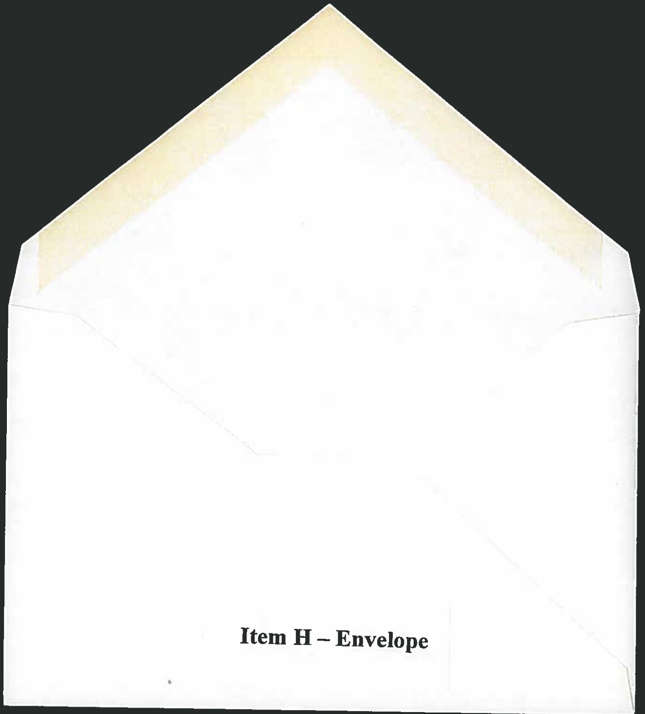
Item H – Envelope