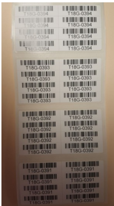
Item 8: Specimen Processing Label (Figure 8)