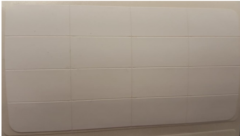
Item 4: Piggy Back Grid Label (Figure 4)