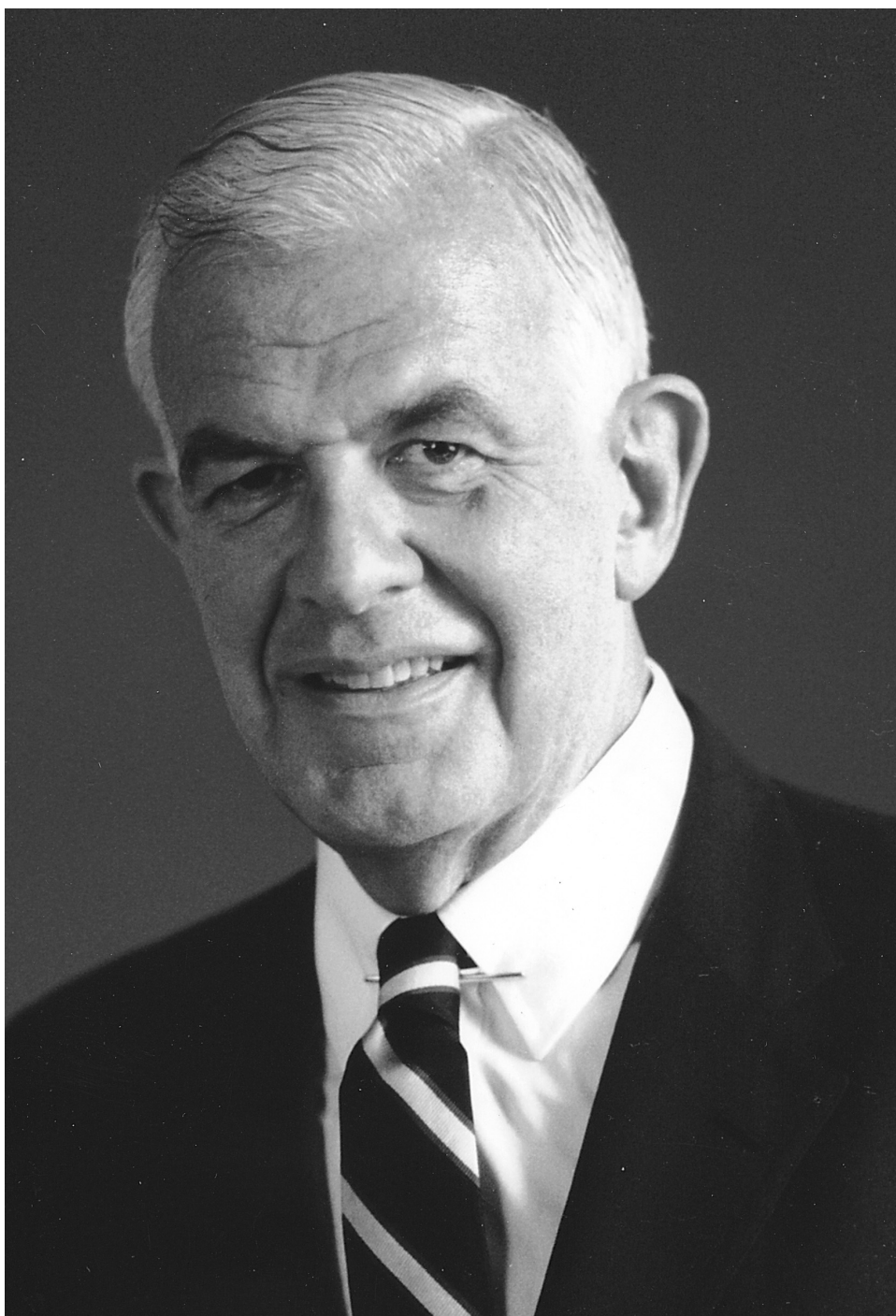
Hon. Thomas S. Foley, Speaker 1989–1995