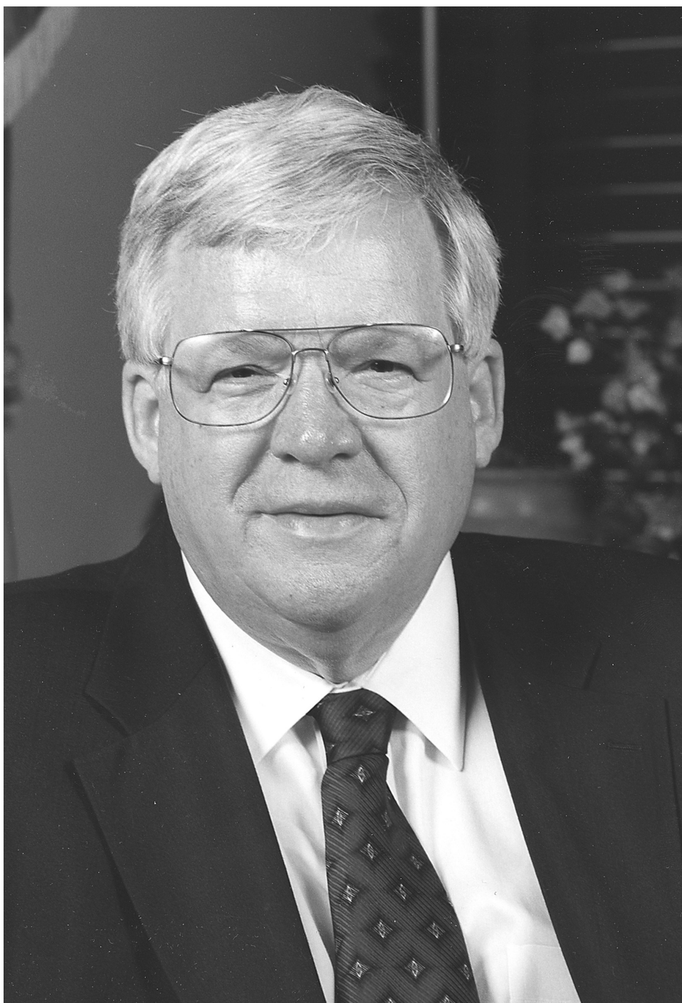
Hon. J. Dennis Hastert, Speaker 1999–