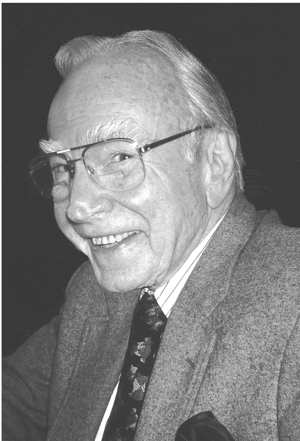
Hon. James C. Wright, Jr., Speaker 1987-1989