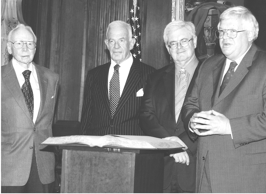
Four Speakers, Cannon Centenary Conference, November 12, 2003