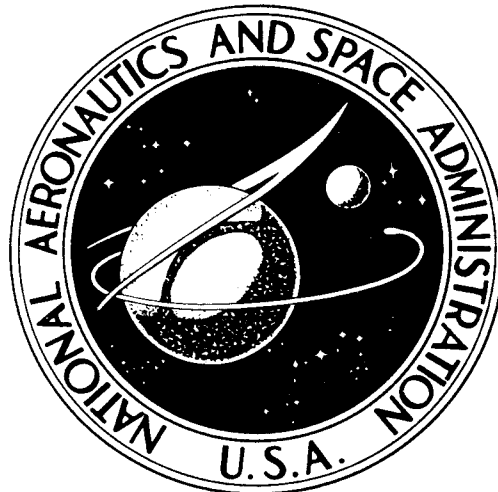
The NASA Seal

The official seal of the National Aeronautics and Space Administration is a disc of blue sky strewn with white stars. To the left, there is a large yellow sphere bearing a red flight vector symbol. The wings of the vector symbol envelope and cast a brown shadow upon it. A white horizontal orbit also encircles the sphere. To the right, there is a small light blue sphere. A white band which circumscribes the disc is edged in gold and is inscribed with "National Aeronautics and Space Administration U.S.A." in red letters.