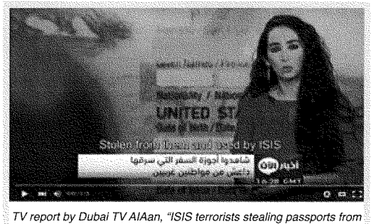
IV report by Dubai TV AlAan, "ISIS terrorists stealing passports fro Westerners" (May 11, 2015) at <u>https://www.youtube.com/watch?</u> <u>v=1mkWW2DX6Mg</u>

We know that legitimate U.S. passports are a high commodity on the black market, including for ISIS and those seeking travel out of Syria. Americans targeted for passport theft are then sold to individuals whose facial likeness best matches the buyer. The same is the case for those from VWP countries who have easy access to the U.S. as well, since the ESTA online application form itself is highly susceptible to fraud.