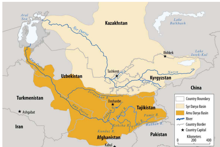
Figure 1: Map of Amu Darya and Syr Darya River Basins

There are two main rivers in Central Asia: the Amu Darya and the Syr Darya. The Amu Darya is the largest river with a basin shared by Afghanistan, Iran, Kyrgyzstan, Tajikistan, Turkmenistan, and Uzbekistan. The river is formed by the confluence of the Vakhsh and Pyanj rivers. The most important river, the Pyanj, begins near Pakistan's Northern Territories and forms the border between Afghanistan and Tajikistan (see Figure 1). There are also several rivers within northern Afghanistan contributing to the Amu Darya flow, mainly the Wakhan and Pamir rivers and, to a lesser extent, the Badakhshan, Kokcha, and Kunduz.