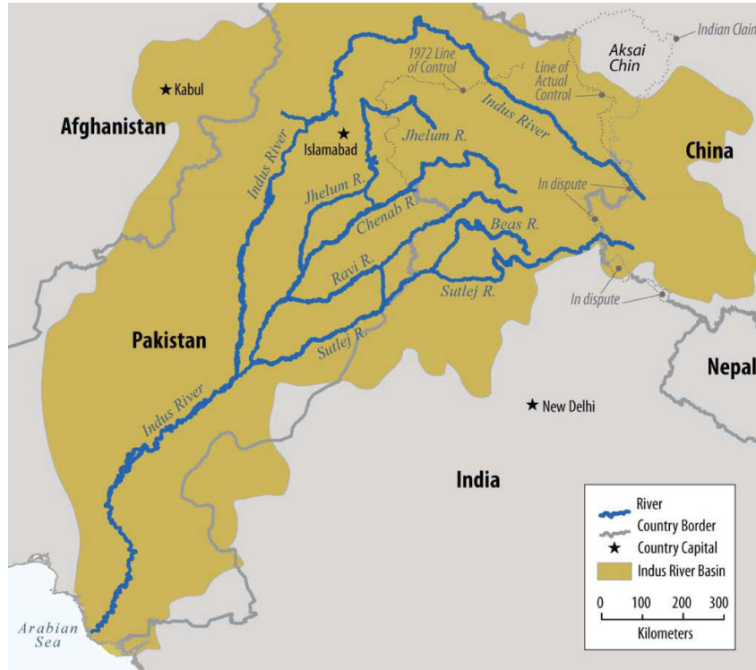
Figure 2: Map of Indus River Basin