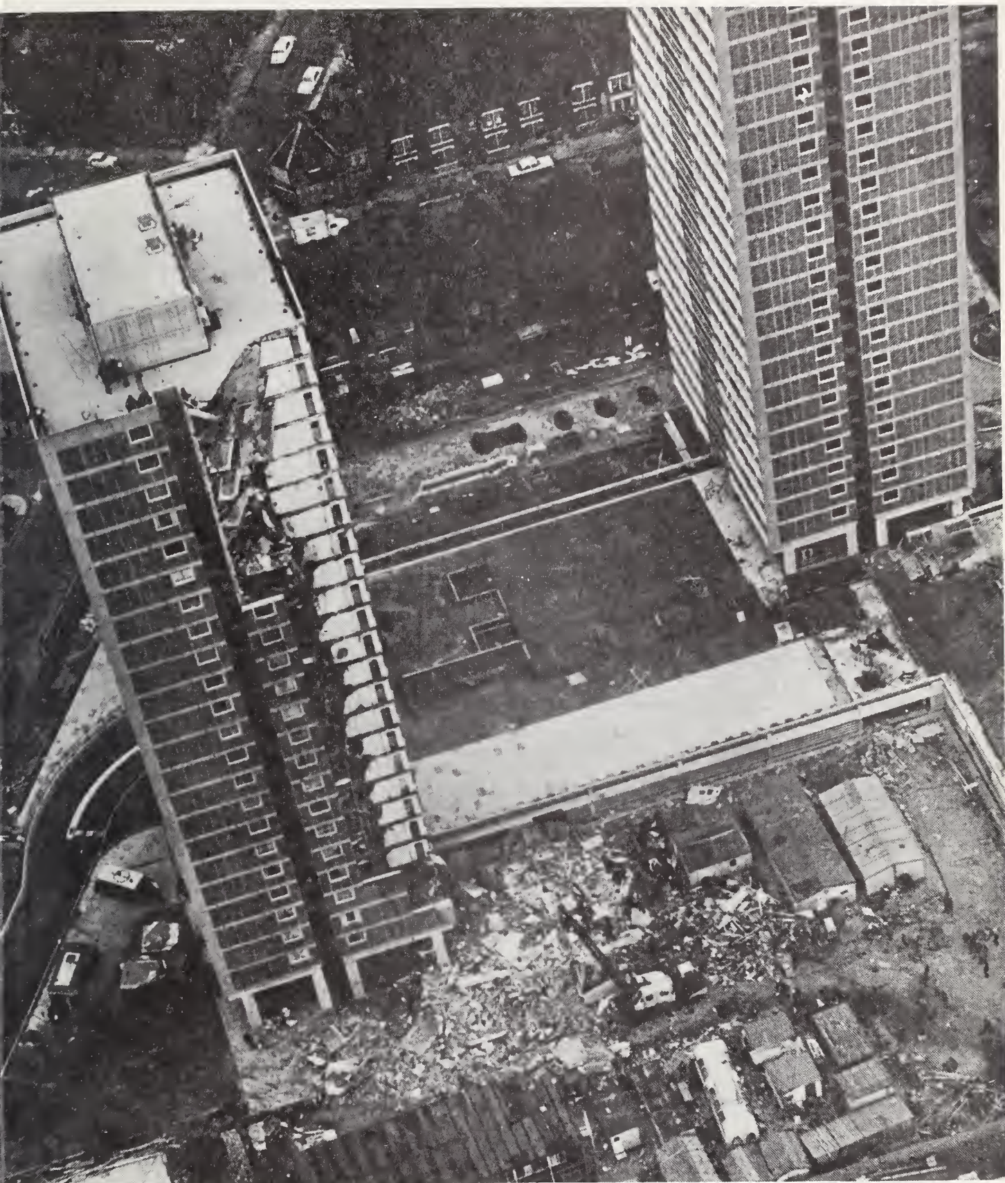
Figure 1 Ronan Point Apartment Building after the collapse, with a second identical building in the background. Reproduced from [1].